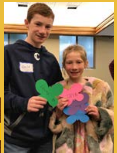
Coffee Hour Question: What word best captures the spirit of this congregation?