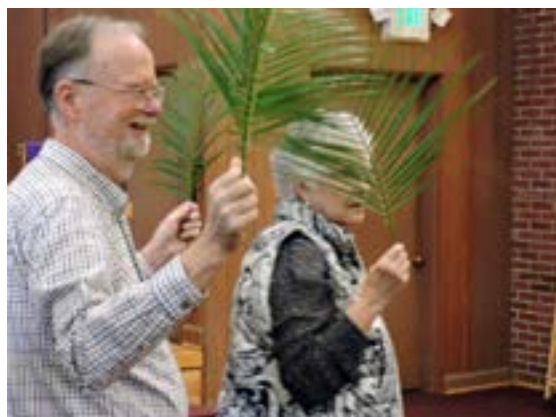
Palm Sunday 2018